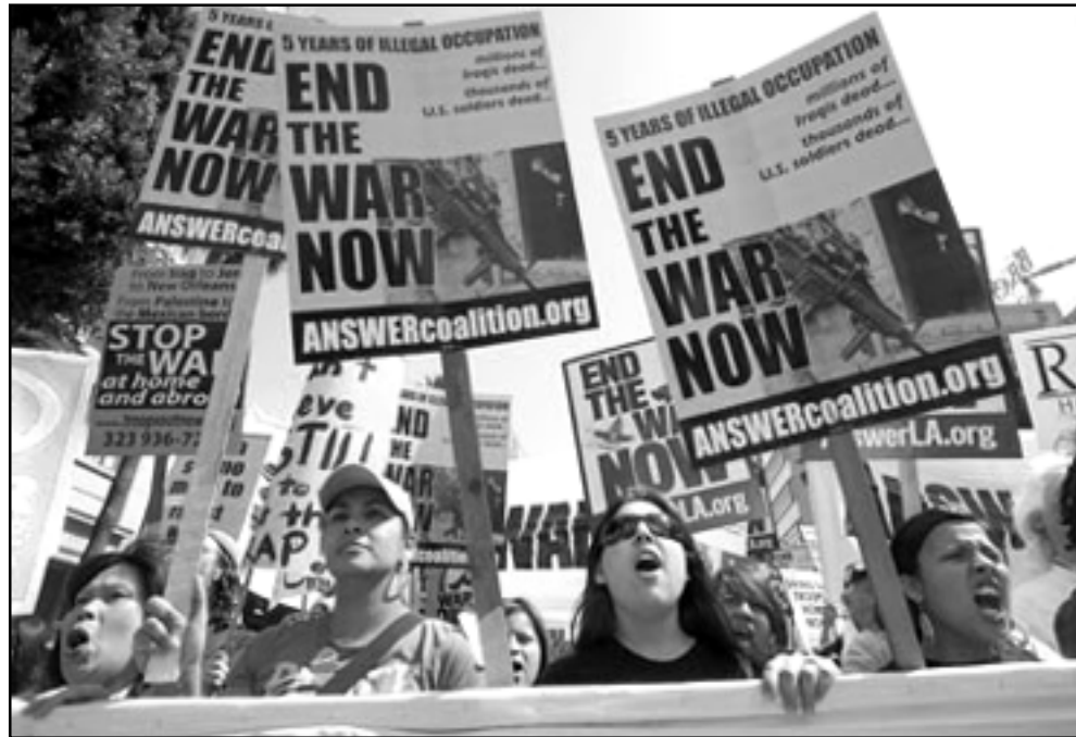
• Anti war protesters in California.

Finally, Atlanta police officers were called in and the