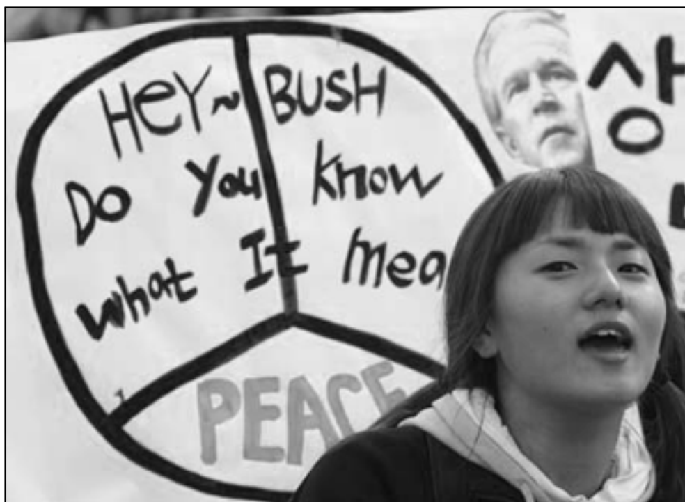
• Anti war protest in Seoul, south Korea.

Earlier last week resistance fighters carried out a bold attack to liberate young captives being held at a puppet regime juvenile facility in Baghdad. The operation had been four months in planning and the prisoners were mostly teenagers related to known partisans, held in an